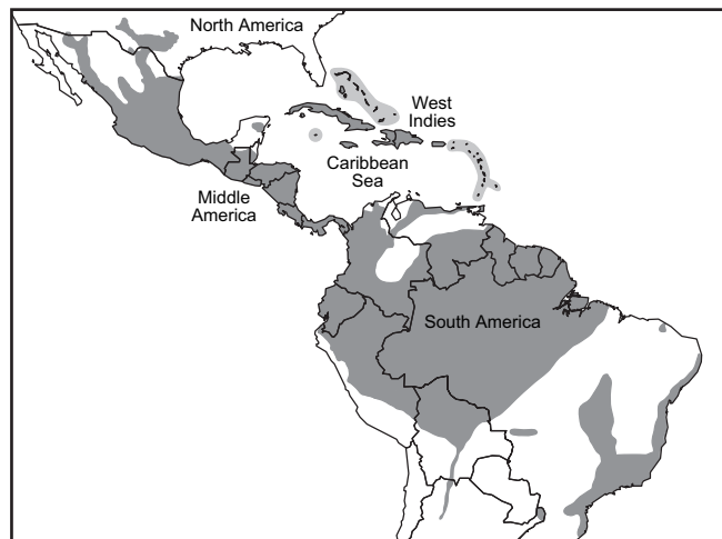
Fig. 1. Composite distribution of eleutherodactyline frogs and Brachycephalus (812 sp.). “Middle America” refers to Central America and Mexico. No evolutionary groupings are implied.

Terrestrial breeding and direct development have allowed eleutherodactyline frogs to occupy a diversity of ecological niches and have facilitated their wide distribution (Fig. 1). Eleutherodactylines occur on almost every island in the Caribbean and display near total endemism to single-island banks. Their elevational range also is broad, with some species occurring up to 4,400 m in the Andes of South America. Thus, they are a model group for studying Neotropical biogeography and evolution. With this in mind, we assembled samples and available sequences of 276 species of eleutherodactylines and Brachycephalus for several mitochondrial and nuclear genes. Our goal was to identify the major groups of species and their times of divergence, to better understand the historical biogeography of eleutherodactyline frogs and the region in general. Our results revealed several major and, for the most part, geographically isolated, clades of eleutherodactyline frogs and showed that the